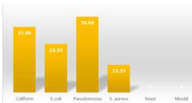
Fig 2: Percentage of bacterial population in household drinking water

Staphylococcus was also identified, and it was the least among others, 13.33%. it's a gram-positive microbe in cocci shape (Masalha et al., 2001) Being pathogenic it causes health issues like spoilage, severe infections and infectious wounds. Unlike Pseudomonas , it occurs in water containing organic matter like pollutants and minerals. Its presence in water clearly indicates the mixing of agricultural runoff and industrial sewage in water. India has adopted on site sanitation which is increasing at a rapid rate and found responsible for increase in nitrate and bacterial contamination (Pujari et al., 2007). Removal of night soils in rural areas at open places like agricultural land has lead to more possibility of open water sources contamination through runoff.