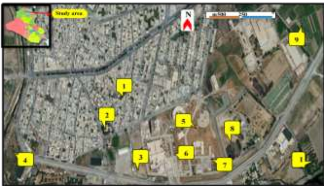
Fig 1: A map of the Al-Rashidiya area showing the sites of studied wells.