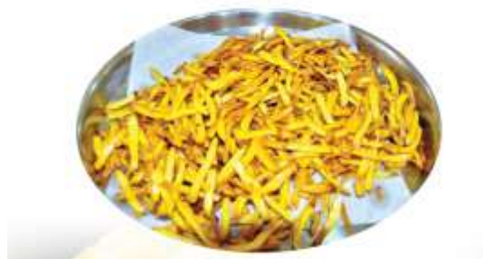
Fig. 1. Jackfruit chips

Annamalai University, Annamalai Nagar. This investigation was carried out to process jackfruit chips with four formulations and five replications in a Completely Randomized Design ( T1- 3.2 %,T2- 2.8 %, T3- 2.4 %, T4- 2 % of salt concentration).The effect of the processing on the nutritional quality and sensory quality of the chips made out of jackfruit were determined. Storage life and cost economics were also calculated in this study.