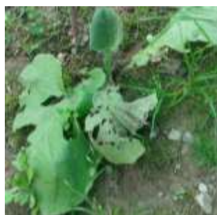
Fig. 1 Rumex dentatus