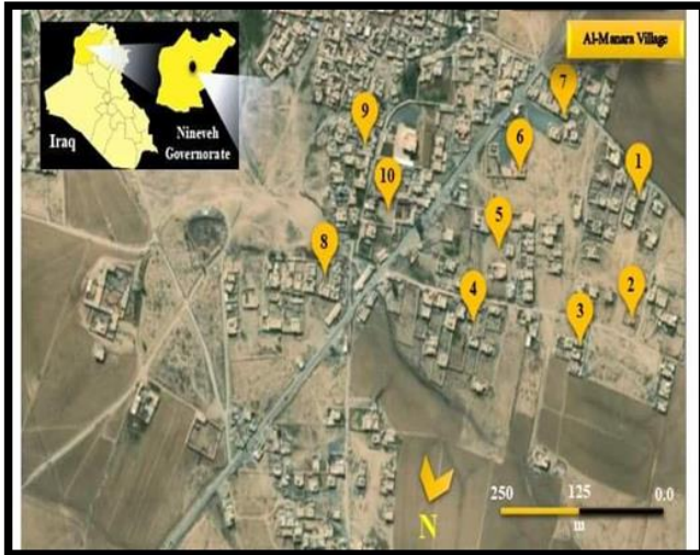
Map 1. A satellite view of the sites for collecting water samples from the wells of Al-Manara village