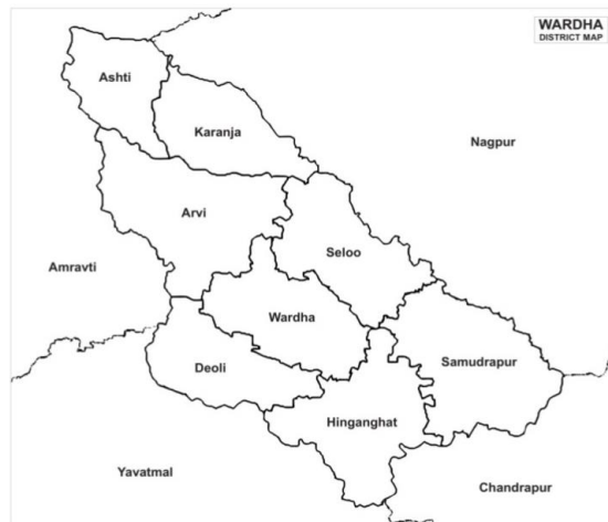
Fig.1 Geographical position of eight tehsil places in district wardha considered in this study

Wardha district is in the state of Maharashtra in India. The geographical location of district wardha is 20.8049° N, 78.5661° E. The species listed were collected from eight tehsil places i.e. Seloo, Wardha, Deoli, Arvi, Ashti, Karanja, Hinganghat, Samudrapur (Fig.1). The habitat selected for collection of ants, the agricultural field, domestic habitat, grassland, tree plantation, and surrounding water bodies. The survey for the collection of ants has been started from 2019 to 2021. We have used all situational and possible methods for the collection of ants but specifically, ants were hand collected by using forceps and brushes.