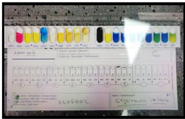
Fig. 2 API 20E test of Pseudomonas luteola

In this study, we used API 20E test and VITEC-2 system to identify Pseudomonas luteola isolate the result shows in Fig. 2 and 3.