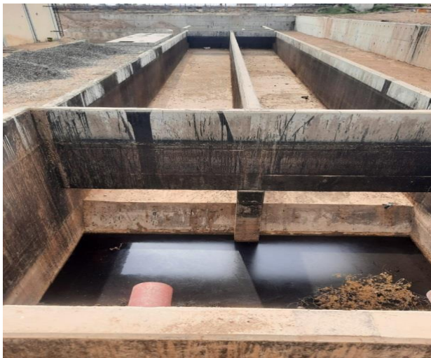
Fig. 2 Wastewater collection area

The concentration of copper was estimated using the Porphyrin Method. This method is considered one of the best and most accurate methods used to estimate copper concentration, as this method is not affected by interfering substances and does not require an extraction or concentration process for the sample before analysis. Work is done to remove the interfering