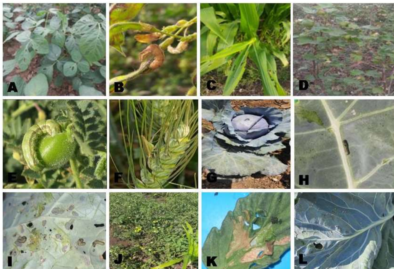
Fig. 1 Affected agricultural crops (A) Soyabean Glycine max , (B) Pigeon pea, (C) Maize Zea mays , (D) Cotton Gossypium , (E) Gram (chana) Cicerarietium , (F) Wheat Triticum , (G) Brassica oleraceavar. capitataf. rubra , (H) Brassica oleraceavar. italica , (I) enlarged view on Brassica , (J) Solanumly copersium , (K) enlarged view on Solanum , (L) Brassica oleraceavar. botrytis

Samudrapur. The geographical location of district Wardha is 20.8049° N, 78.5661° E. The observations were carried out from 2019 to 2022, during the respective cropping season (Fig.1).